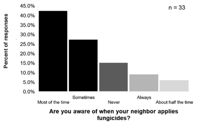
Figure 1 Frequency of grapegrowers' responses to the question on whether they were aware of when their neighbor applied fungicides.

This estimate can be used to determine the range of probabilities that a grower in our study would be willing to adjust fungicide use when offered compensation. The probability that a grower would adjust their use if they were compensated for profit loss ("Yes" on Question 37, Supplemental Information) ranged from ~50 to 65%. The lowest end of the range is the probability associated with a grower who also chose "No" or "Unsure" for all of the questions included in the baseline willingness-to-adjust index. The highest probability is associated with a grower who chose "Yes" for all the included questions. This indicates that the grower has a very high baseline willingness to adjust their fungicide use practices to mitigate the causes and/or consequences of fungicide resistance.